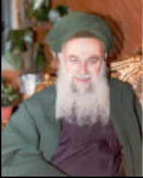
Mawlana Shaykh Nazim Al-Haqqani