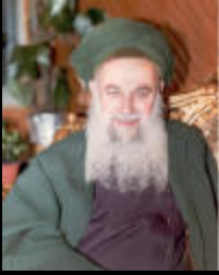
Mawlana Shaykh Nazim Al-Haqqani